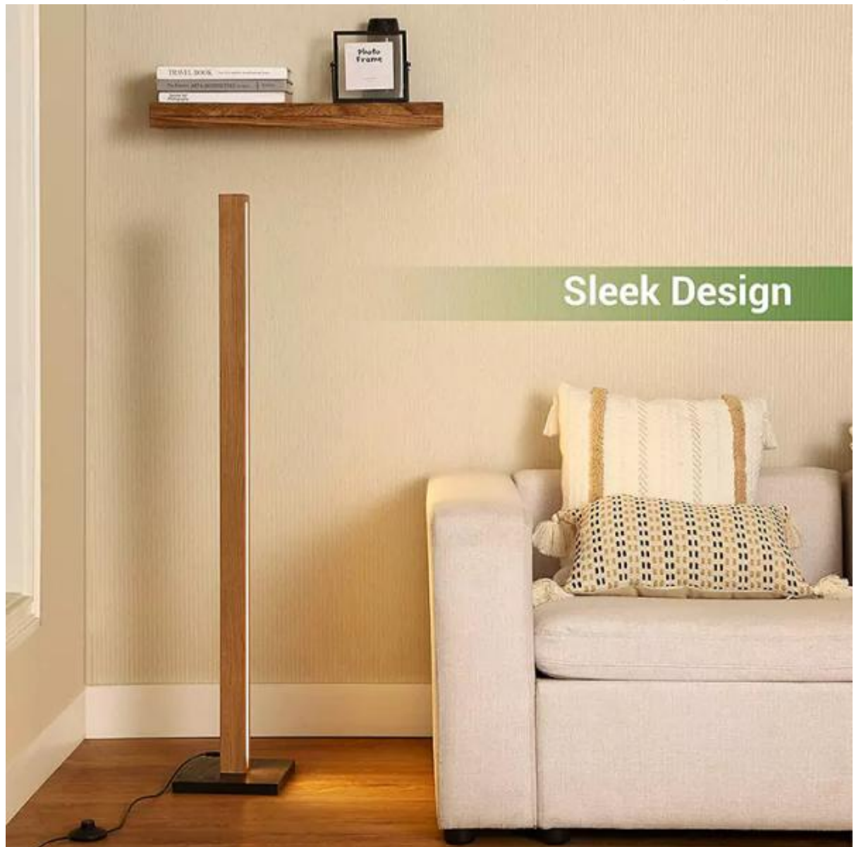
Effect of our led floor lamp indoor

Dongguan City Tianhua Photoelectric Technology Co., Ltd.